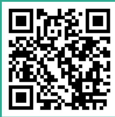
SCAN THE QR CODE TO APPLY